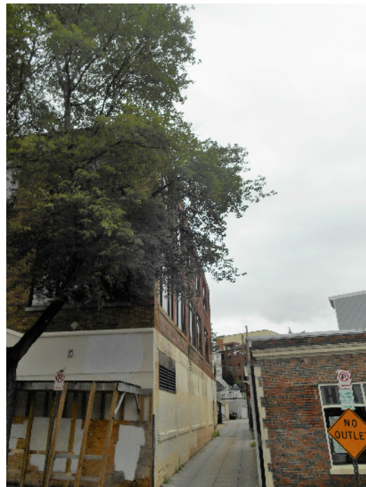
VIEW D: THE ADJACENT ALLEY