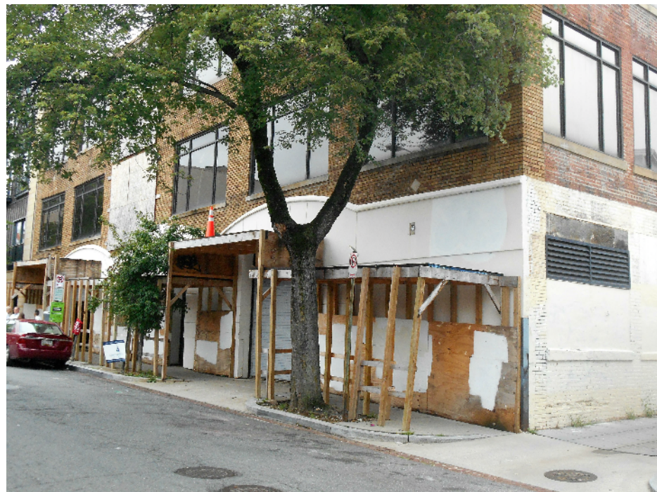
VIEW C: NW CORNER FROM KALORAMA RD NW LOOKING SOUTH EAST