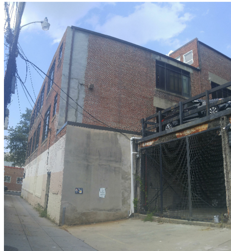
VIEW B: SW CORNER FROM THE ALLEY LOOKING NORTH