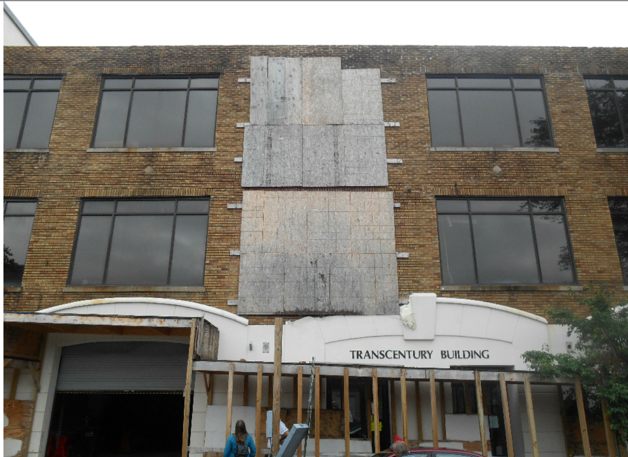
VIEW A: NORTH ELEVATION FROM KALORAMA RD NW LOOKING SOUTH