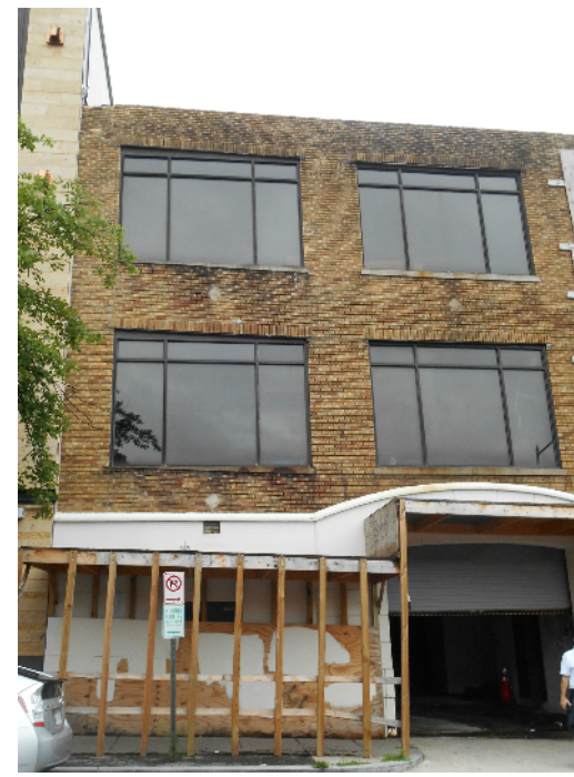
VIEW E: NE CORNER FROM KALORAMA RD